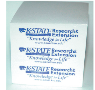
MK11 Post-It Notes - $0.70

Cube of note paper with K-State Research and Extension logo on all four sides.