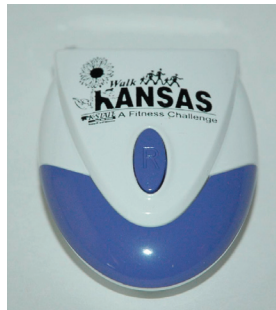
MK15 Top-View Pedometer - $3.06

*Note: This item now includes the new Walk Kansas logo.