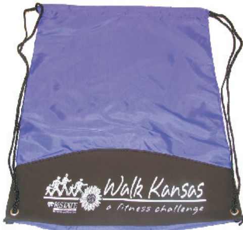
MK23 Drawstring Backpack - $2.10

*Note: This item now includes the new Walk Kansas logo.