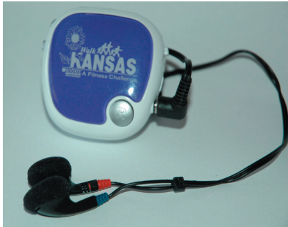
MK14 Walk 'n Roll Pedometer - $5.78

Purple and white pedometer with Walk Kansas and K-State Research and Extension logos. FM radio, comes with headphones.