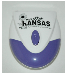
MK15 Top-View Pedometer - $3.06

*Note: This item now includes the new Walk Kansas logo.