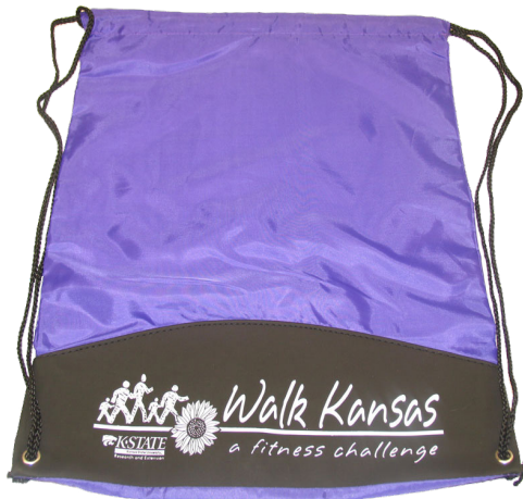
MK23 Drawstring Backpack - $2.10

*Note: This item now includes the new Walk Kansas logo.