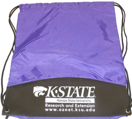
MK24 Drawstring Backpack - $2.21

Purple nylon pack with black accent and K-State Research and Extension logo.