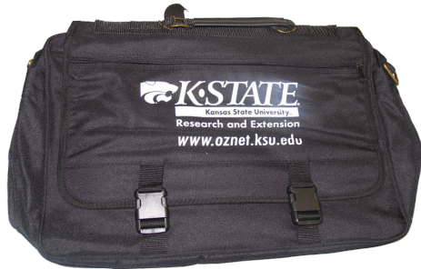
MK20 Canvas Bag - $12.57

Folded length: 15.5", rib: 22" Diameter: 36.5", arc: 44"