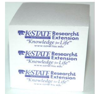
MK2 Note Cube - $2.72

Translucent purple 15 oz. travel mug. Imprinted with K-State Research and Extension logo in white. Thumb slide spill proof lid. Comfort handle.