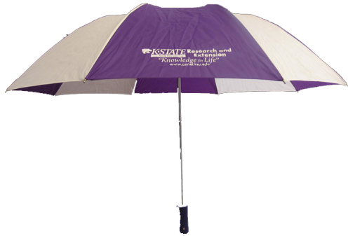
MK22 Umbrella - $7.76

Automatic open, steel, wind-proof frame, purple and white nylon fabric, plastic rubberized handle. With K-State Research and Extension logo.