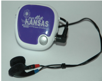
MK14 Walk 'n Roll Pedometer - $5.28

Purple and white pedometer with Walk Kansas and K-State Research and Extension logos. FM radio, comes with headphones.