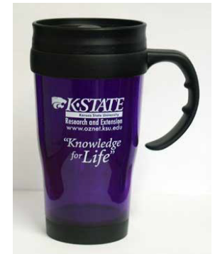
MK1 Travel Mug - $2.53

White 18 oz. water bottle with purple sport cap and K-State Research and Extension logo.