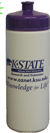
MK44 Water Bottle - $0.98

White 18 oz. water bottle with purple sport cap and K-State Research and Extension logo.